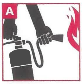
AIM AT THE BASE OF FIRE