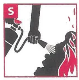
SWEEP SIDE TO SIDE